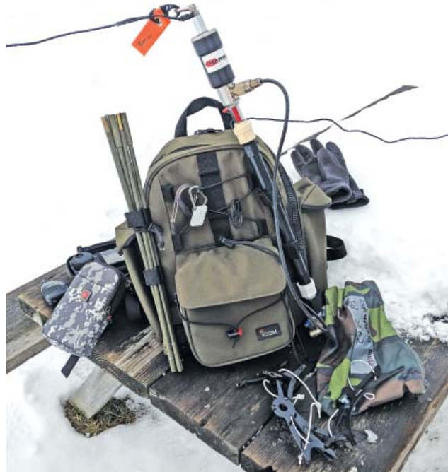
Figure 11 — The Chameleon Antenna MPAS 2.0 backpack setup.

I have used this antenna in all its configurations, from deployment to experimentation, and have always been happy with the results. This is not necessarily a short com-