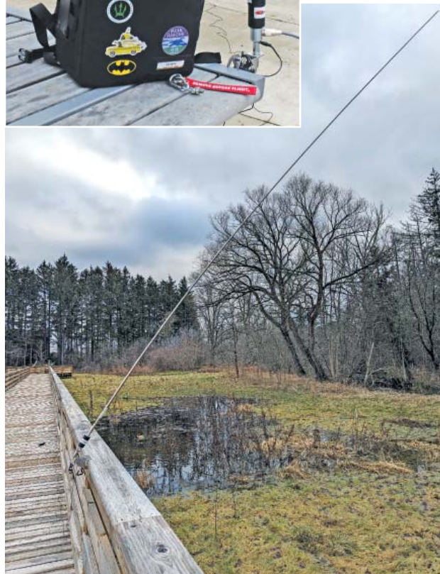
▼ Figure 9 — The Chameleon Antenna MPAS 2.0 attached to a boardwalk.