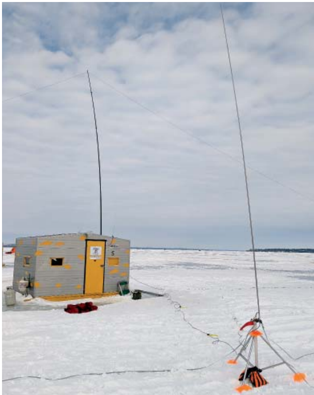
Figure 10 — The Chameleon Antenna MPAS 2.0 attached to an ice hut installation.

This allows the antenna to be attached to a backpack. Just thread the antenna through the MOLLE straps. I have also deployed this on Alice and Icom backpacks in stationary mode (being careful of power lines), or you can simply have the backpack on a picnic table. I have tried this with a CB mirror mount on a Pelican go-box for a simple setup. See Figure 11 for a sloper setup.