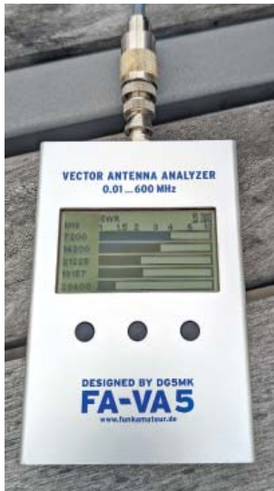
Figure 12 — The Chameleon Antenna MPAS 2.0 9-foot SWR sweep.