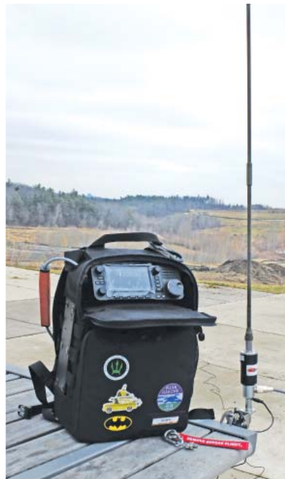
◀ Figure 8 — The Chameleon Antenna MPAS 2.0 attached to a picnic table.

A balcony rail mount is perfect for apartment/condo operators, and any antenna mount can be used against a railing. I suggest attaching lightweight paracord to all components and securing them to prevent them from crashing down to the street. I have used the MIL whip by itself with great success, making contacts in Europe on 20 meters. Personally, the use of the SS17 whip or addition of the MIL EXT is physically too cumbersome at nine floors above ground, but a MIL whip set up is ideal for bands from 20 meters and up. Now think about how easy